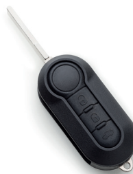
Silca Remote SIP22R34